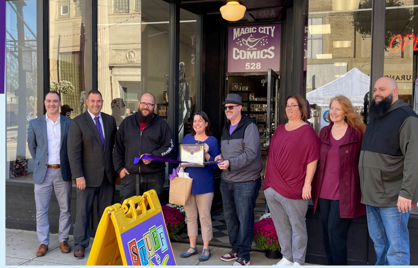
Above: Magic City Comics ribbon cutting on September 24, 2022.