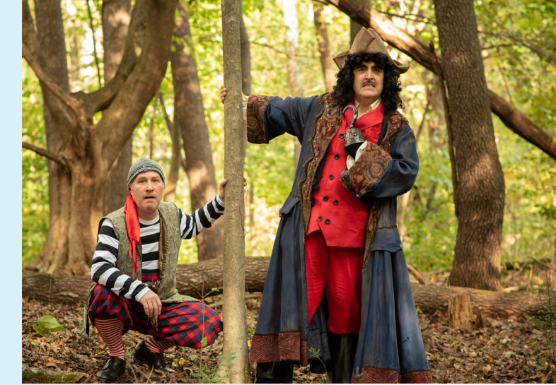
Above: Magical Theatre Company produced a series called Tales on the Trails, run in partnership with the Cuyahoga Valley National Park, as a creative outdoor theatre option during COVID restrictions.