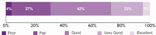
Figure 1. Quality of Life in Barberton

Read the executive summary of our needs assessment.