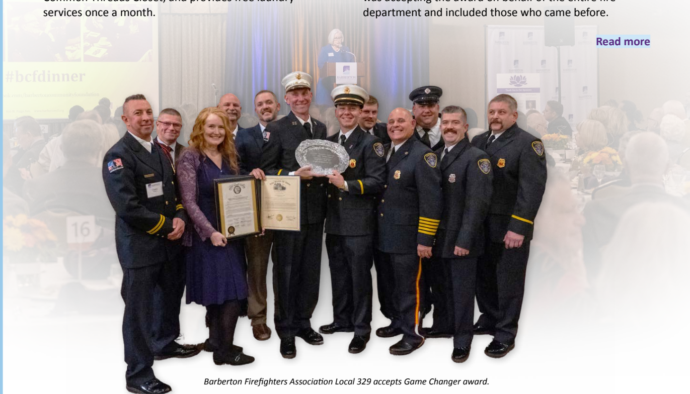
Barberton Firefighters Association Local 329 accepts Game Changer award.

Watch our Game Changer Highlight Videos .