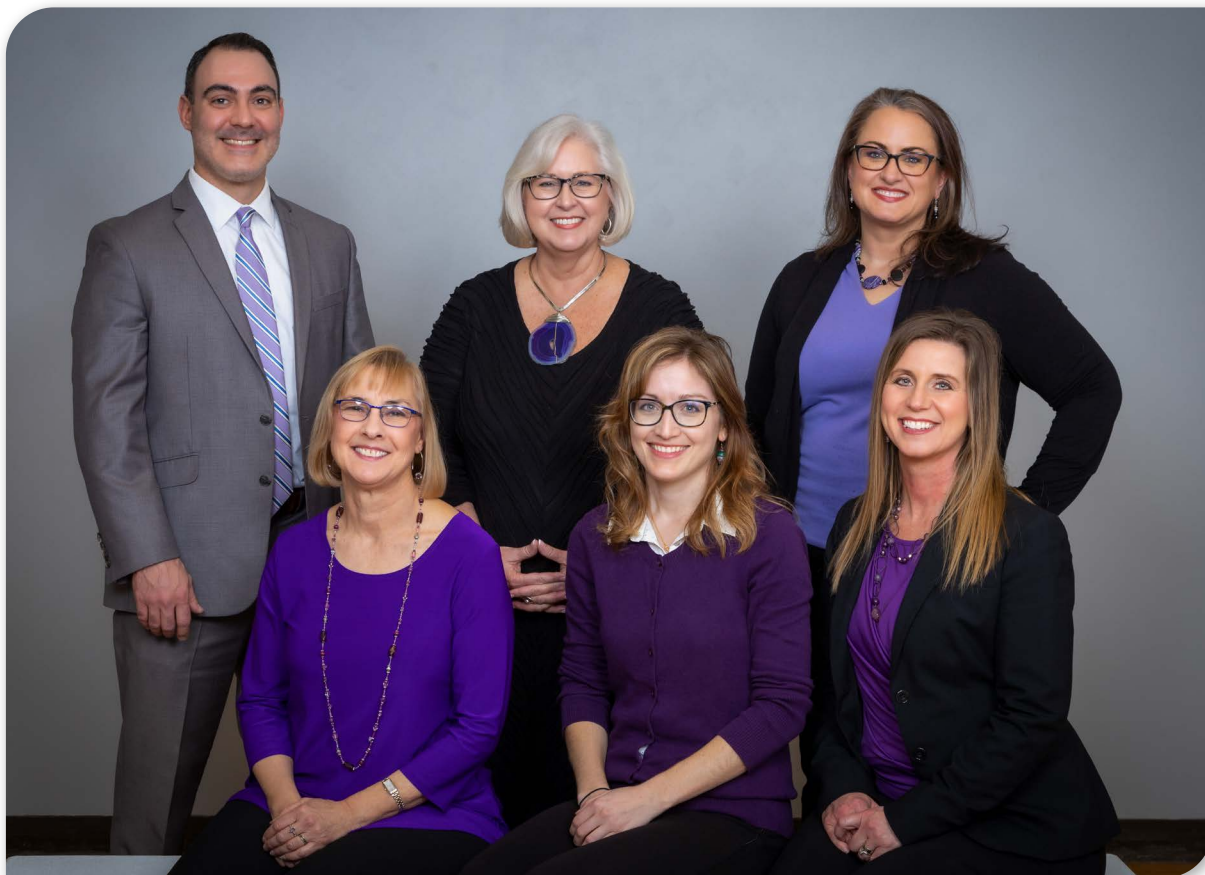
The Barberton Community Foundation staff.