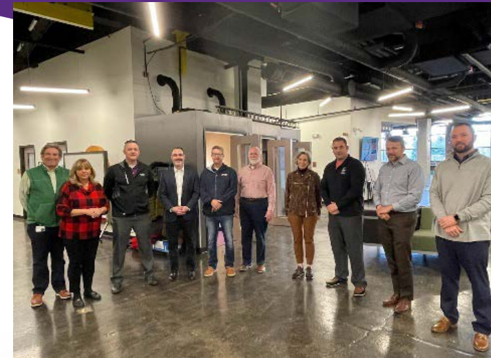
Members of the Foundation's economic development committee visited Bounce Innovation Hub in March, 2022 to tour the facility and learn more about their programs.