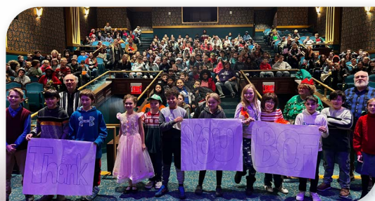
2022 grant partner, Magical Theatre Company.