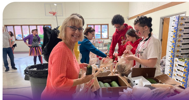
Akron Canton Regional Food Bank distribution day at The Salvation Army.

Humane Society of Summit County was awarded $10,000 to support the MABEL Mobile Veterinary Clinic visits to Barberton. The MABEL bus provides veterinary services such as spay and neuter for dogs and cats, as well as vaccines. Funding allows low-income Barberton residents to utilize the clinic for free. Funding is expected to cover spay/neuter services for 172 cats and dogs and vaccines for 80 cats and dogs.